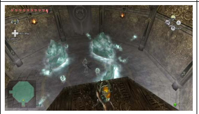
Floor 30 2x Chilfos 6x Mini Freezards 8x Ice Keese