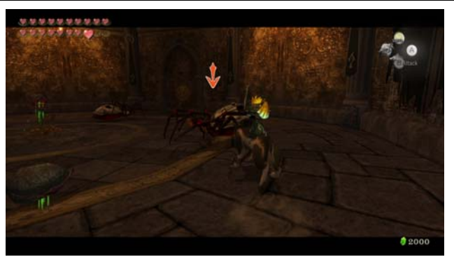
Floor 21 3x Skulltulas 5x Deku Babas