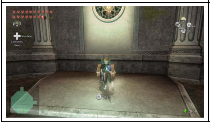
Floor 20 Chest: 1x Purple Rupee Dig: 1x Recovery Heart