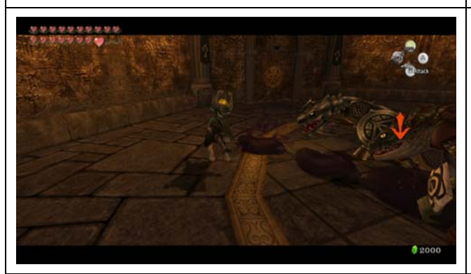
Floor 34 3x Lizalfos 1x Dynalfos Xx Chuchus