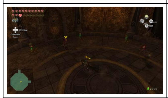
Floor 24 4x ReDead Knights 8x Deku Babas