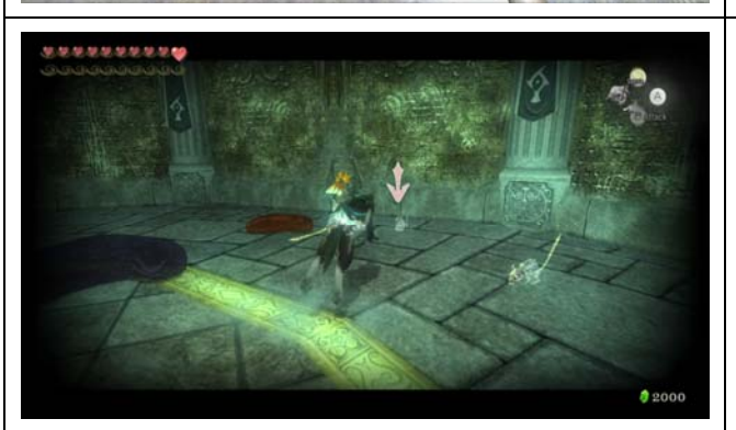
Floor 29 Xx Chuchus Xx Ghoul Rats