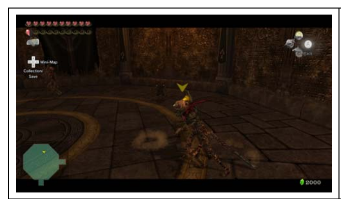
Floor 27 2x Bulblin Archers 3x ReDead Knights