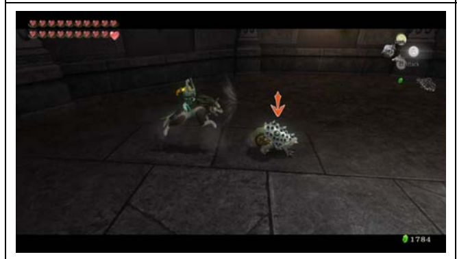
Floor 10 4x Helmasaurs