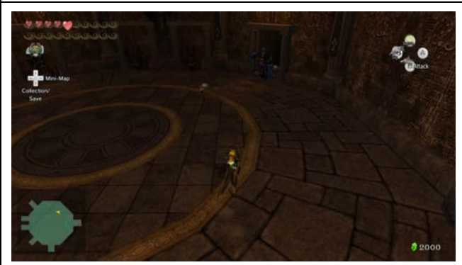
4x Armos Gate 1: 5x Baby Gohma Gate 2: 3x Keese 3x Rats Gate 3: 7x Rats 3x Keese Gate 4: 5x Baby Gohma