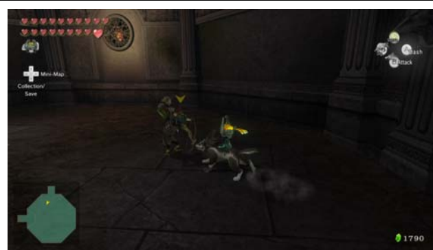
Floor 13 3x Bulblin Archers