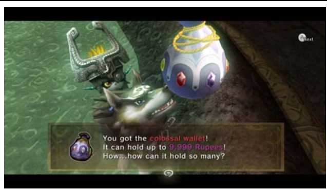
Floor 40 – Spirit Spring 1x Colossal Wallet