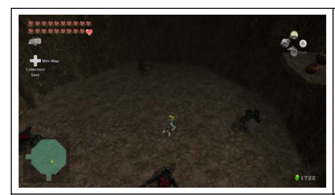
Floor 2 4x Shadow Beasts