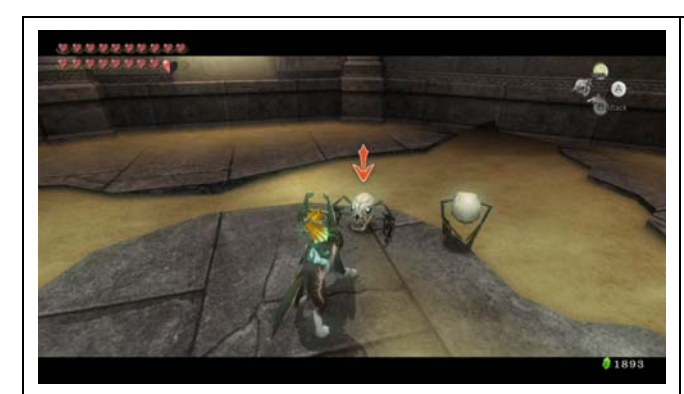
Floor 17 15x Bubbles