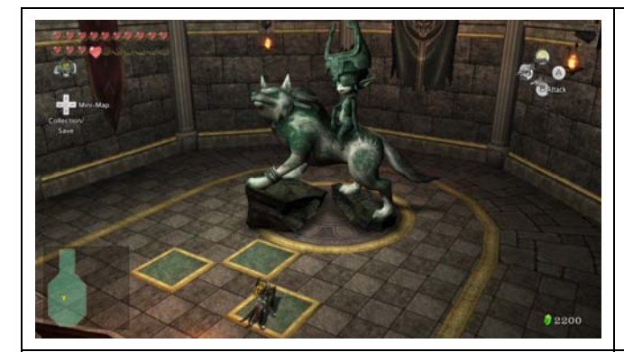
Floor 40 – Statue Room

Chest: 1x Silver Rupee Dig: 1x Orange Rupee