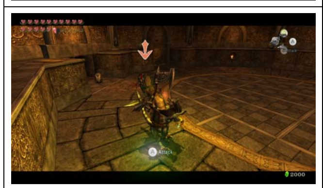
Floor 39 – Gate 3 2x Helmasaurs 4x Keese 1x Dynalfos