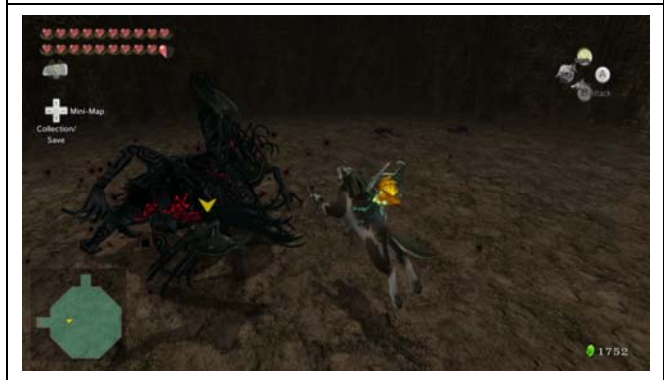
Floor 5 4x Shadow Beasts 4x Shadow Vermin