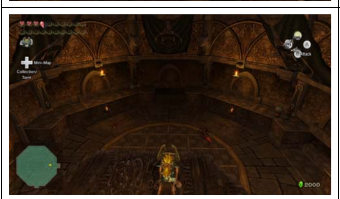
Floor 39 – Phase 1 2x Dodongos 4x Baba Serpents