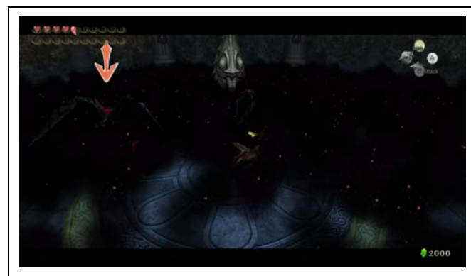
Floor 37 4x Zant Masks 4x Shadow Keese