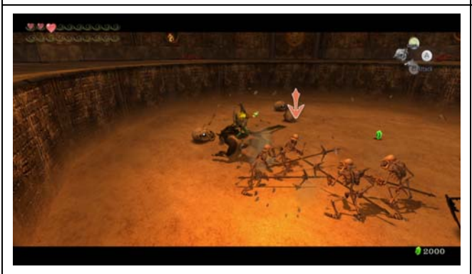
Floor 39 – Phase 2 2x Fire Bubbles 2x Ice Bubbles 7x Stalkin