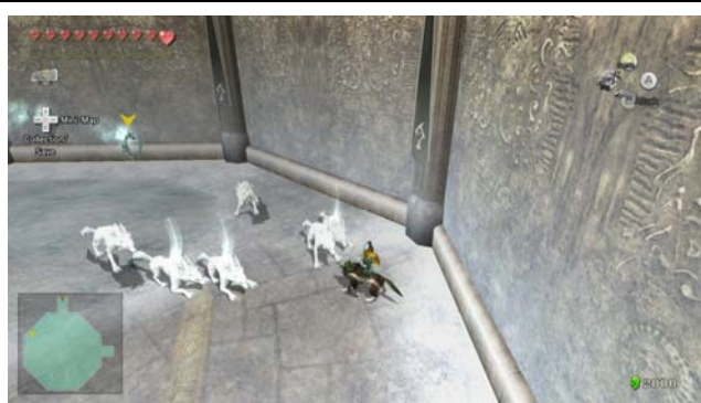
Floor 28 8x White Wolfos 6x Ice Keese