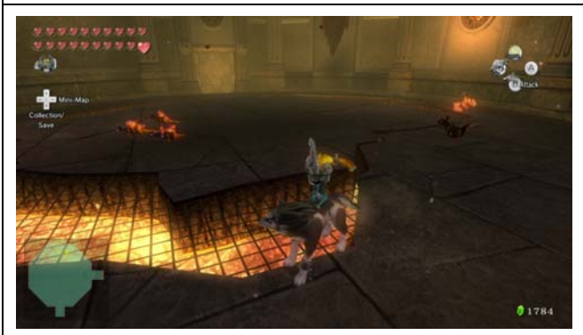
Floor 11 9x Torch Slugs