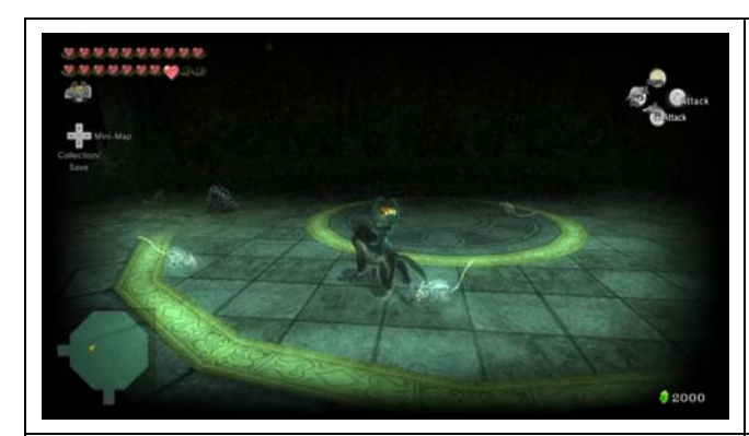
Floor 22 3x Helmasaurs Xx Ghoul Rats