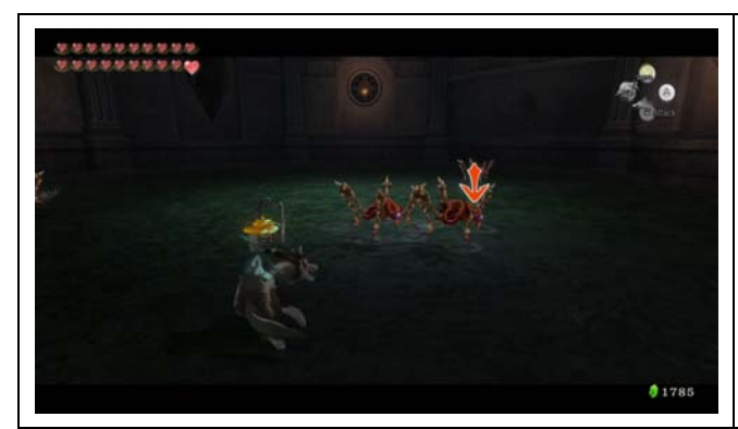
Floor 12 6x Tektites