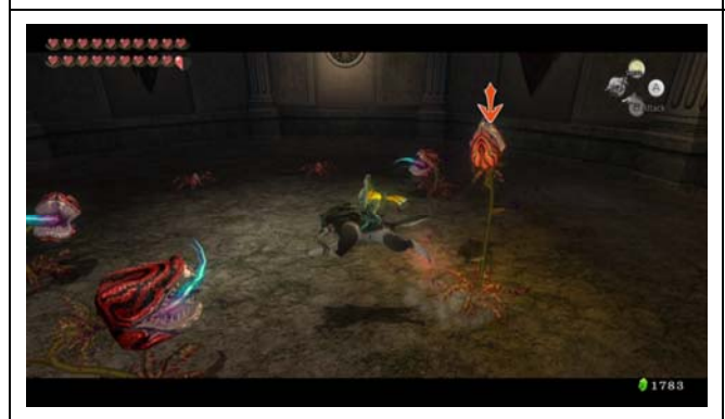
Floor 9 6x Baba Serpents