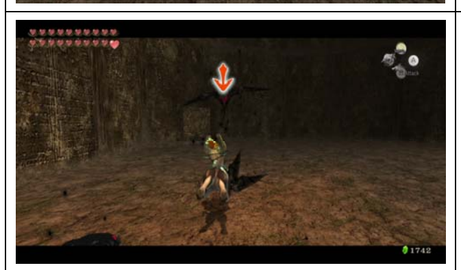
Floor 4 4x Shadow Keese 4x Shadow Vermin