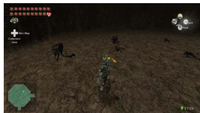
Floor 3 4x Shadow Vermin 3x Shadow Baba