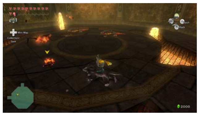
Floor 25 2x Dodongos 6x Fire Keese 15x Torch Slugs