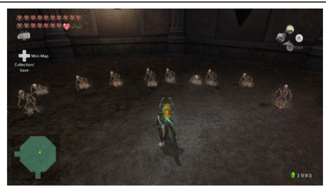
Floor 18 20x Stalkin