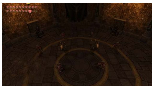
Floor 23 2x Lizalfos 4x Armos 6x Blue Bokoblins