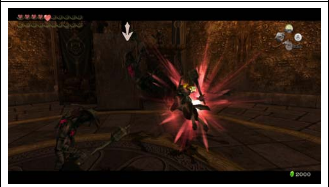
Floor 36 2x Shadow Bulblin Archers 6x Shadow Bulblins