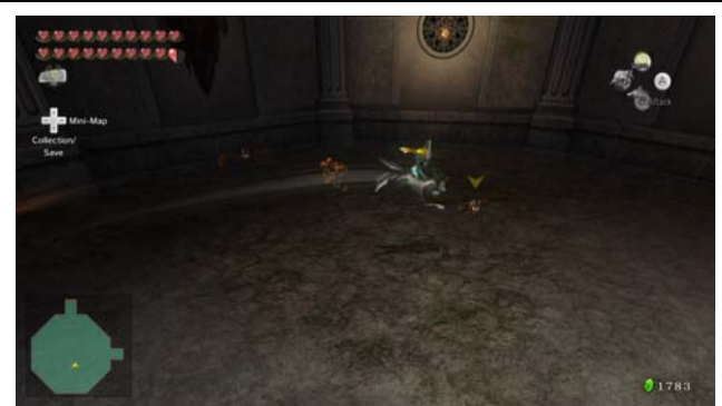
Floor 8 8x Keese