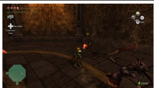
Floor 38 3x Bulblin Archers 4x Bokoblins