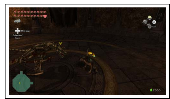
Floor 32 1x Dynalfos 1x Lizalfos 2x Blue Bokoblins