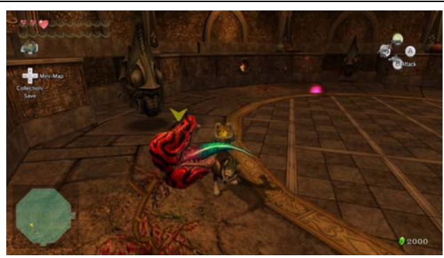
Floor 39 – Phase 3 3x Zant Masks