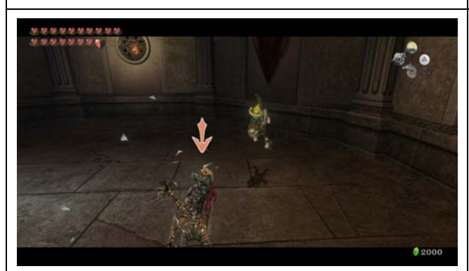
Floor 19 2x ReDead Knights