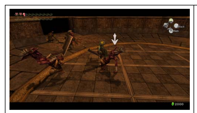
Floor 39 – Gate 1 3x Bokoblins 2x Bulblins