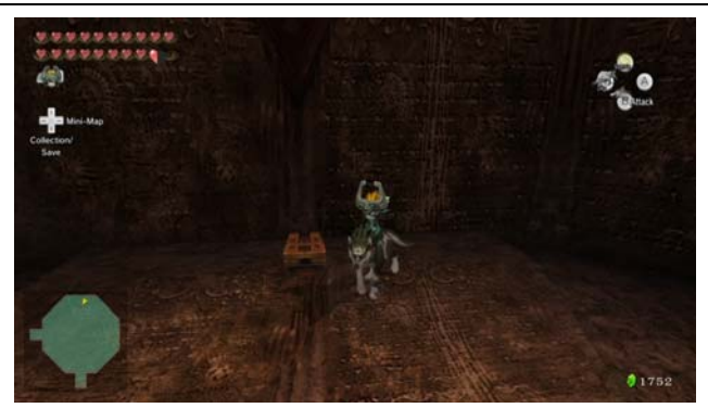
Floor 6 Chest: 1x Red Rupee Dig: 1x Recovery Heart