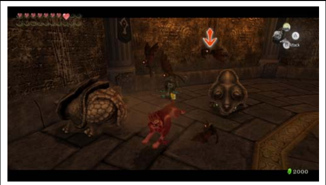
Floor 35 2x Helmasaurus 5x Deku Babas 10x Keese