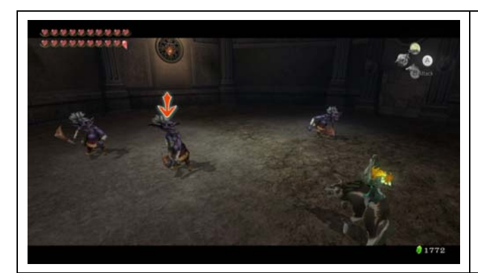
Floor 7 4x Blue Bokoblins