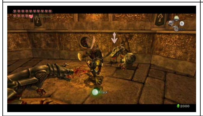
Floor 39 – Gate 4 2x Dynalfos 1x Lizalfos