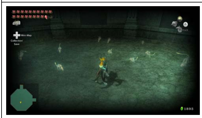
Floor 16 X x Ghoul Rats