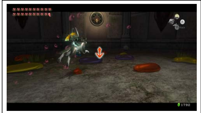
Floor 15 X x Chuchus