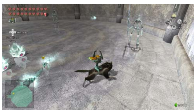
Floor 33 6x Ice Keese 2x Chilfos 4x Mini Freezards