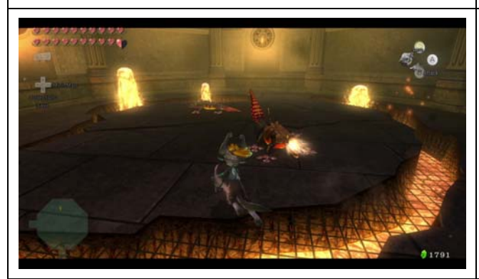
Floor 14 3x Dodongos